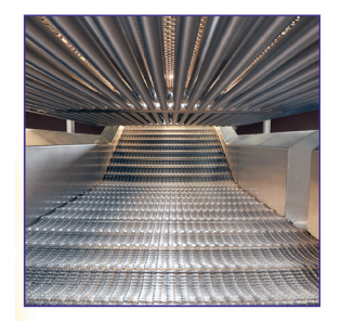
Heat transfer tubes and hood can be lifted clear of the fines removal conveyor to simplify cleaning.